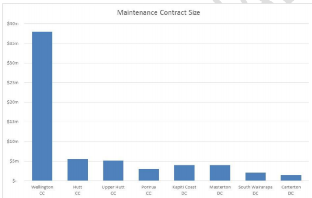
Figure 1 Current road maintenance contract details across Wellington Councils

The Contract document for CDC/SWDC is being reviewed at present to be advertised at the end of February. A Multi-party funding agreement (MPFA) between Carterton District Council and South Wairarapa District Council in respect of Road Network Maintenance has also been developed.