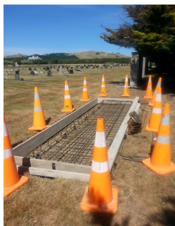
Martinborough Cemetery – Ashes Wall 6 – 33 Niches Completed

A new ashes wall for Martinborough will be erected in the New Year.